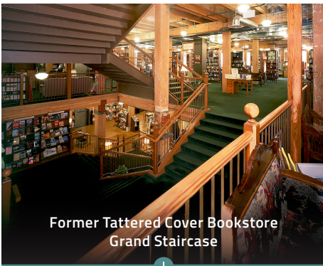
Former Tattered Cover Bookstore Grand Staircase