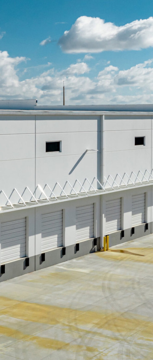
BUILDING 2 50,570 SF