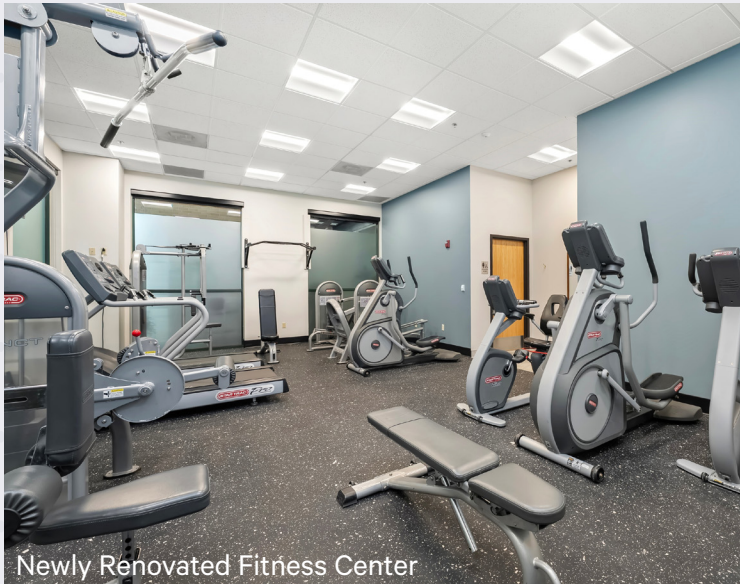
Newly Renovated Fitness Center