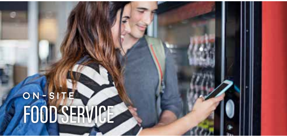
ON-SITE FOOD SERVICE