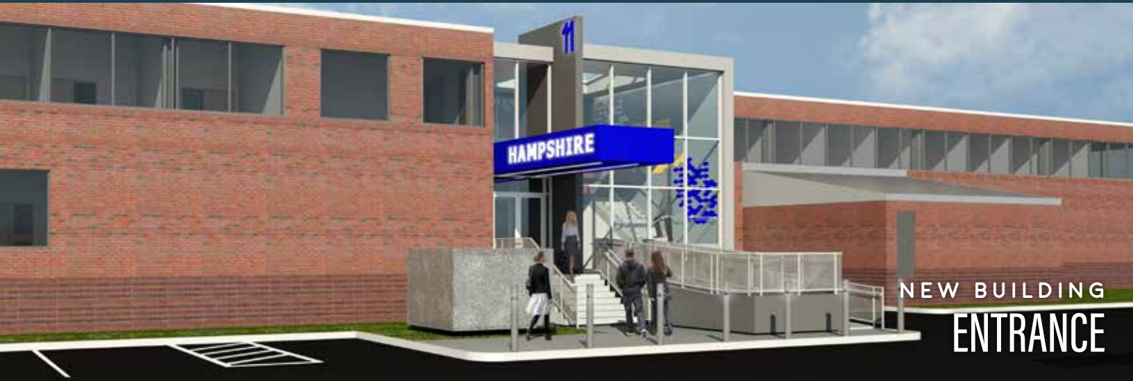
NEW BUILDING ENTRANCE