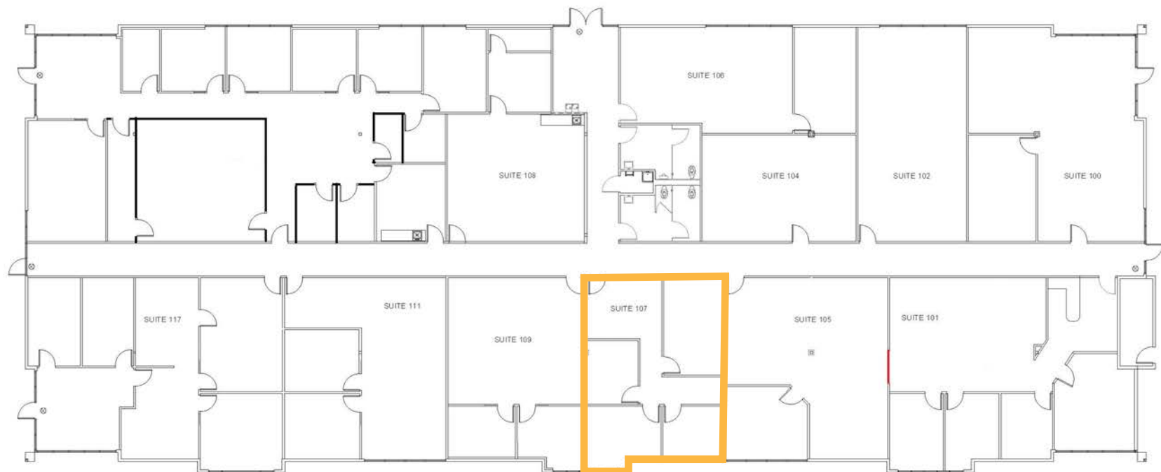
SUITE 107 ±984 RSF

Located in the heart of Roseville, this suite is surrounded by a vibrant mix of amenities. You'll be just steps away from local restaurants, charming shops , and major retail destinations including the Westfield Galleria Mall, The Fountains, Creekside Town Center, and Costco —everything you need, right at your fingertips.