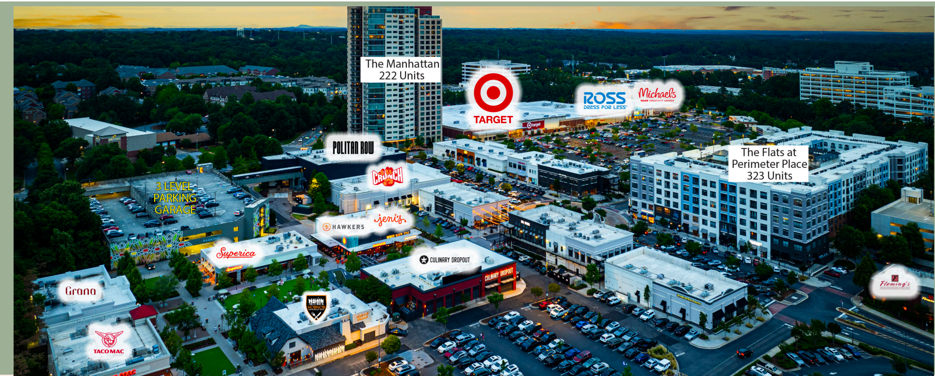
The Manhattan 222 Units